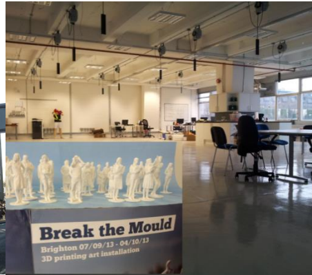
Fusebox creative space

Partners: Brighton & Hove City Council, Department of Communities & Local Government (Greater Brighton City Deal)