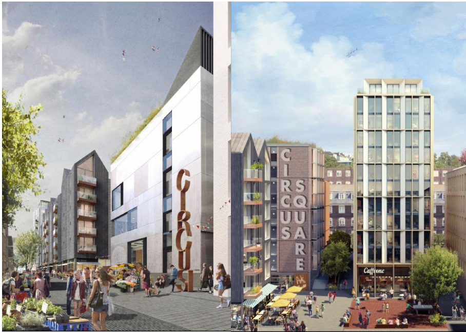
The scheme designs