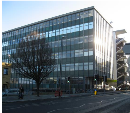
New England House